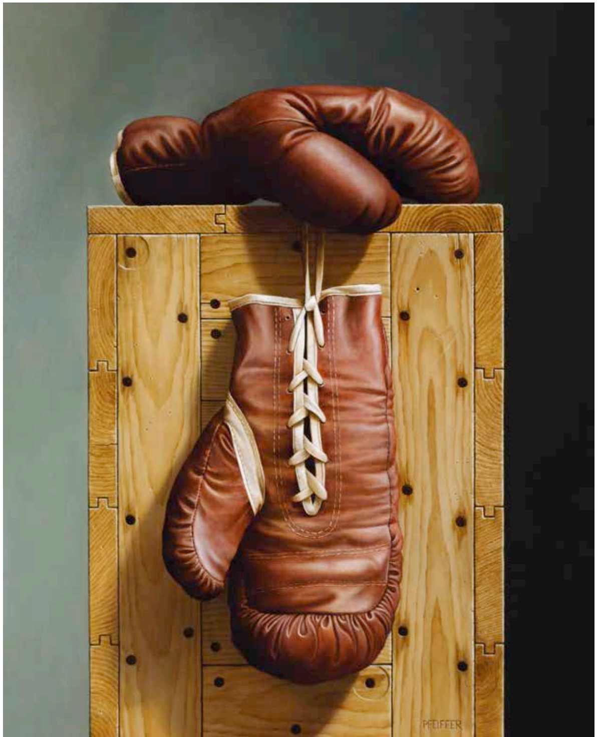
1 Leslie Gabosh, Landed , oil on panel, 8 x 6"