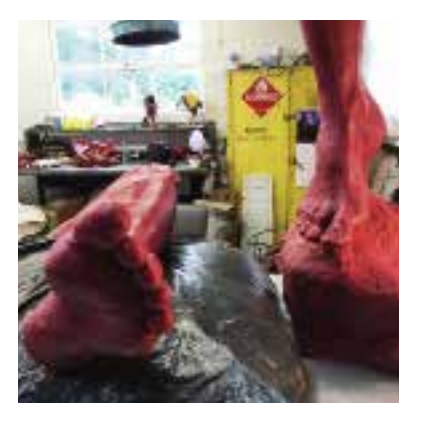
WAX REWORKED: The rubber mold is moved to the foundry, where wax is poured into it. Marcus then reworks the dried wax form. Here her reworked wax awaits "gating," during which wax sprues will be attached so that molten bronze will flow evenly later in the process.