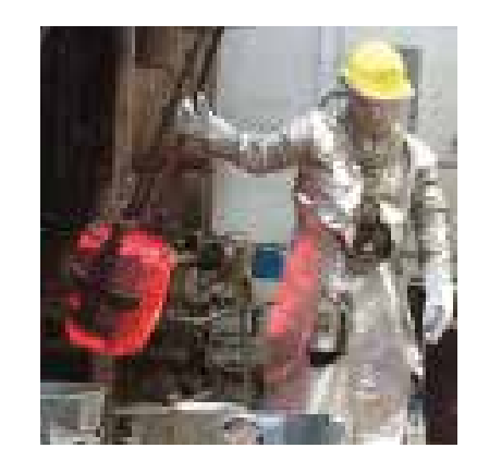
METAL POURED: Molten bronze is poured into the ceramic shell, and then is left to cool.