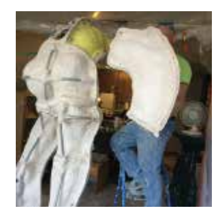
PLASTER REMOVED: A fabricator removes the plaster ("the mother mold") from the rubber mold. This plaster retains the form of the rubber mold; the aluminum rods visible here provide extra support to the plaster.